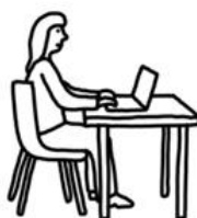
CREATING ONLINE WORSHIP