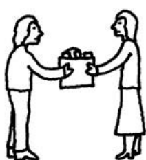
HELPING AT THE FOOD BANK