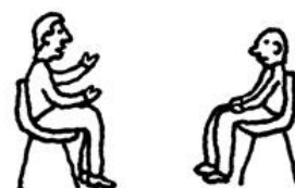
RUNNING THE DEBT ADVICE CENTRE