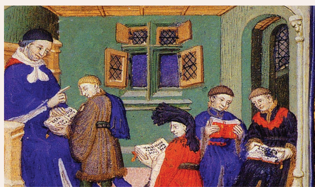
Illustration from: By Moonlight I Must Go to My Book