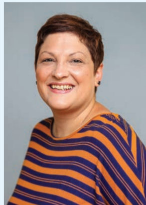
Above: Our Support Team