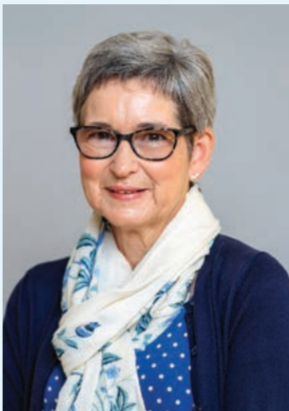
Above: Our Trustees

The Coddendam Centre has often described its need for voluntary help to continue its success story. We have been indebted to all those who have played a part, since 2019 (and in times before).